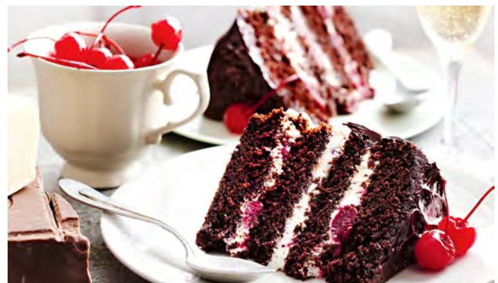
Black Forest Cake