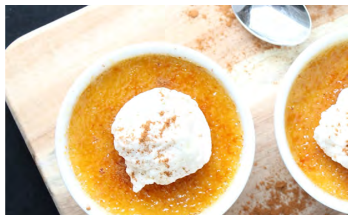
Creme Brulee and Whipped Cream