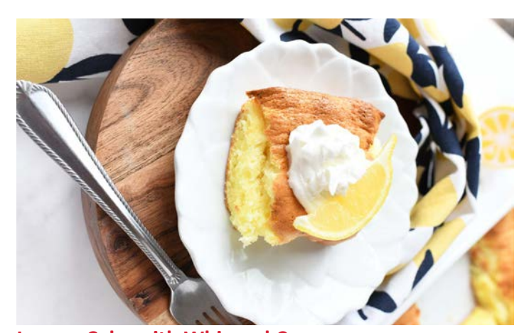
Lemon Cake with Whipped Cream