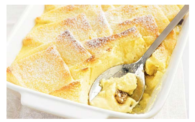
Bread and Butter Pudding Custard