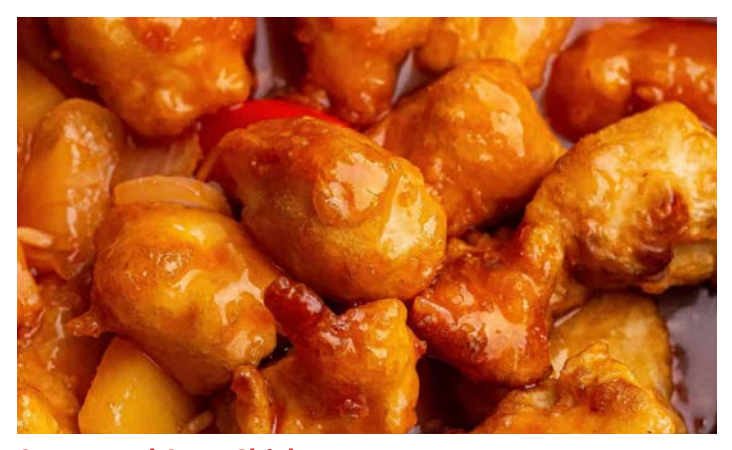
Sweet and Sour Chicken