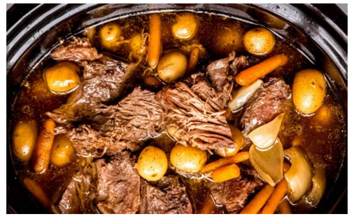
Pot Roast with Root Vegetables