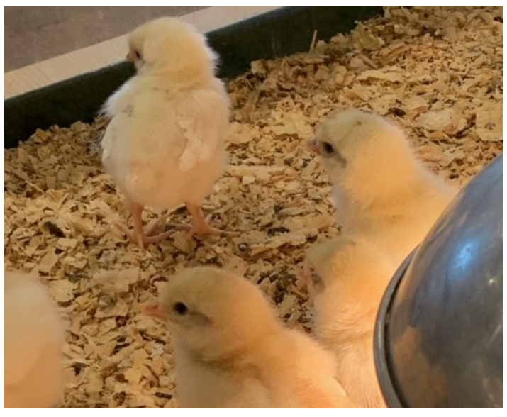
Stay warm, everyone! Elise and the Lifestyle team